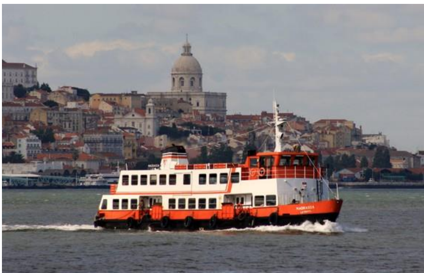
Crossing from Lisbon (North Bank) to Almada (South bank) by boat

Almada is a city located on the southern margin of the Tagus River, on the opposite side of the river from Lisbon. The two cities are connected by the 25 de Abril Bridge. The population in 2011 was 174,030, in an area of 70.21 km 2 .